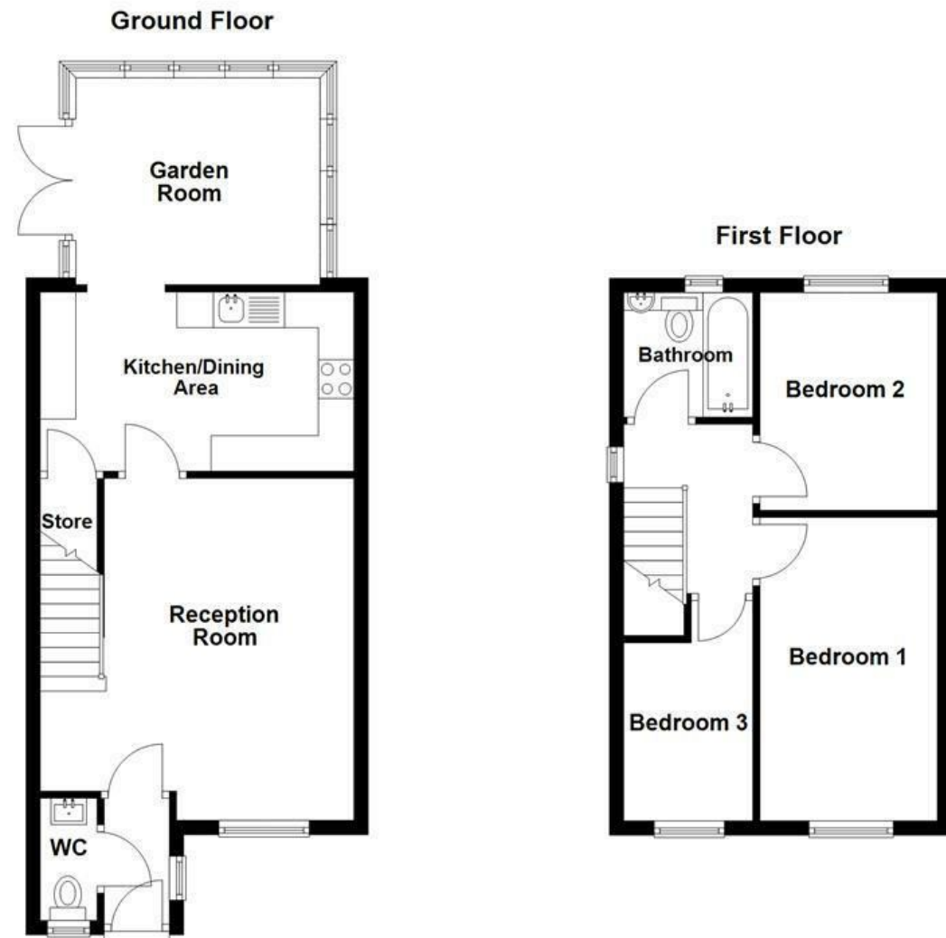
15 Simmons Way, Clayton Le Moors